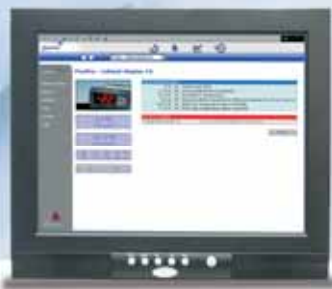
(**) display touch screen 15" opzionale

(**) the 15" touch screen monitor PVSTDMBLM0, complete with wall-mounting brackets, can be purchased separately. It ensures an excellent display of the data and alarm logs and the graphs created using PlantVisor Enhanced.