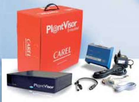
Kit PlantVisor Embedded